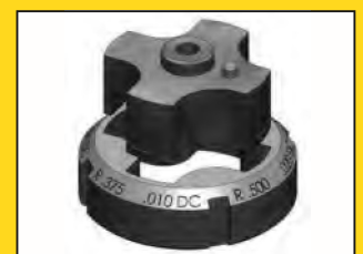
4000 Radius Tool Punch and Die

Note: Custom and metric radii sizes are available upon request. Contact the UniPunch Sales Department for a quote.