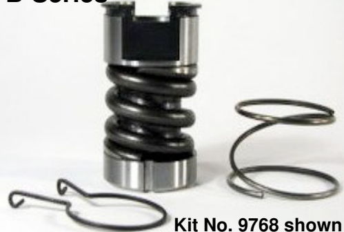
Kit No. 9768 shown