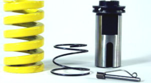
Kit No. 9736 shown